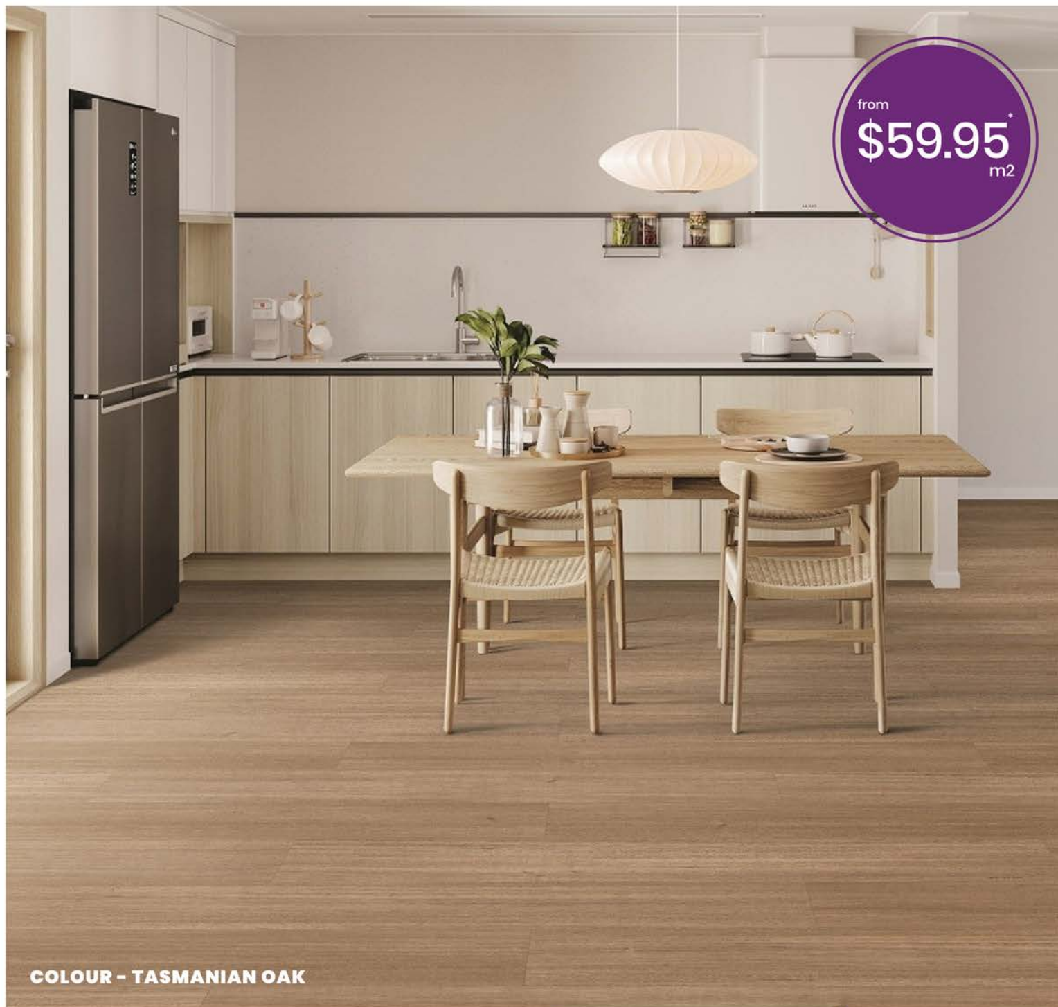
COLOUR - TASMANIAN OAK